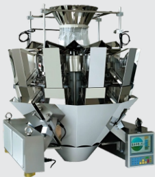
Multihead Weigh Filler