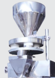
Volumetric Cup Filler